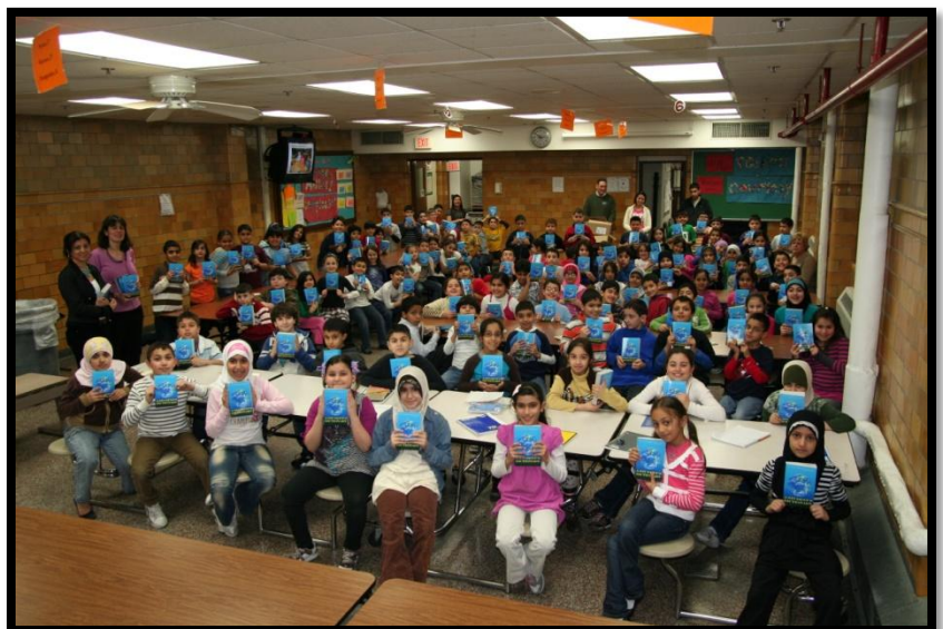
Above: It's all smiles as the third graders at Maples Elementary are given their own copy of a special Gazetteer version dictionary.