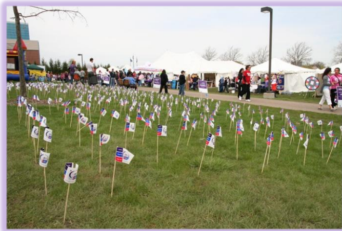
Above: Flags are placed in the ground to symbolize unity amongst all those who are fighting together for the cure.